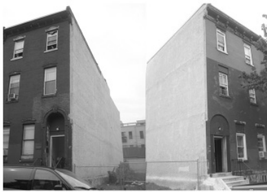
Vacant lot before

Spring Garden Community Development Corporation