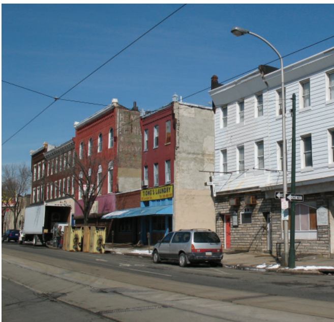
3900 block of Lancaster Avenue