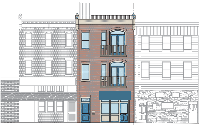
Lancaster Avenue façade

The roof deck, which affords panoramic views, will be surrounded by a green roof. Other sustainable design elements, including a rainwater cistern for irrigation, recyclable building materials and increased insulation, will contribute to the building's pursuit of LEED certification.