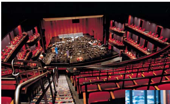
Theatre Interior Perspective

In its campus setting, the new complex centralizes the local arts community, serving the principal cultural organizations in the region, including the West Virginia Symphony Orchestra, Sunrise Museum, and regional theatre and dance groups.