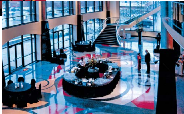
Theatre Lobby for Social Functions