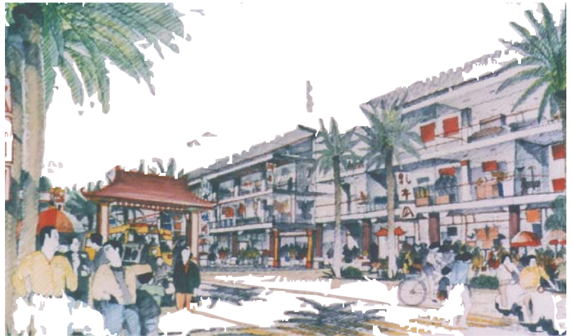
View of shops and offices along the Transit Boulevard