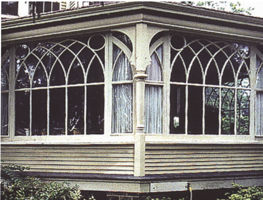
Repaired two bays on east elevation of enclosed wrap-around porch