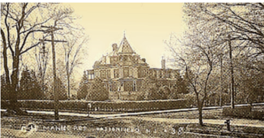
Circa 1890 view of Lullworth Hall

The two-phase project included restoration of turned porch columns and trim to their original appearance, and repairs to the slate and standing-seam metal roofing, gutters and downspouts, and stone piers. KSK provided the architectural services for the restoration work; presented the project to the local historic preservation commission and obtained its approval; assisted with applications to potential funding sources; and prepared a prioritized scope of work with cost estimates for phased repairs. KSK also prepared three reports: a brief history of the building with accompanying historic photographs; a conditions assessment and maintenance guidelines for the roofs, gutter system, and selected deteriorated elements; and a project completion report. All work was undertaken in compliance with New Jersey Historic Trust standards, local histories preservation ordinance requirements, and The Secretary of the Interior's Standards for the Treatment of Historic Properties .