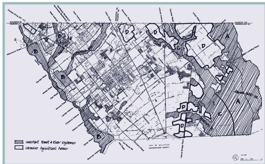
Conservation objectives of the master plan set forth areas of limited density and no development.