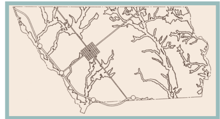
Founded in 1861, a one-mile square town surrounded by 32,000 acres of agricultural land formed the basis of today's Vineland.